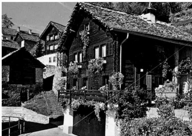
A typical view of Campello