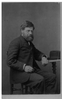
Front & reverse from one of Gaudenzio's photographs