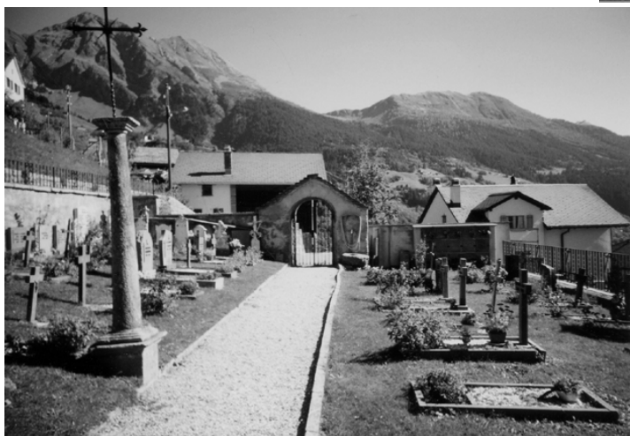
The cemetery of Campello